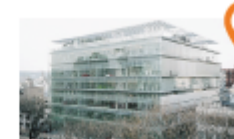
SENDAI MEDIATHEQUE 2-1 Kasuga-machi, Aoba-ku, Sendai